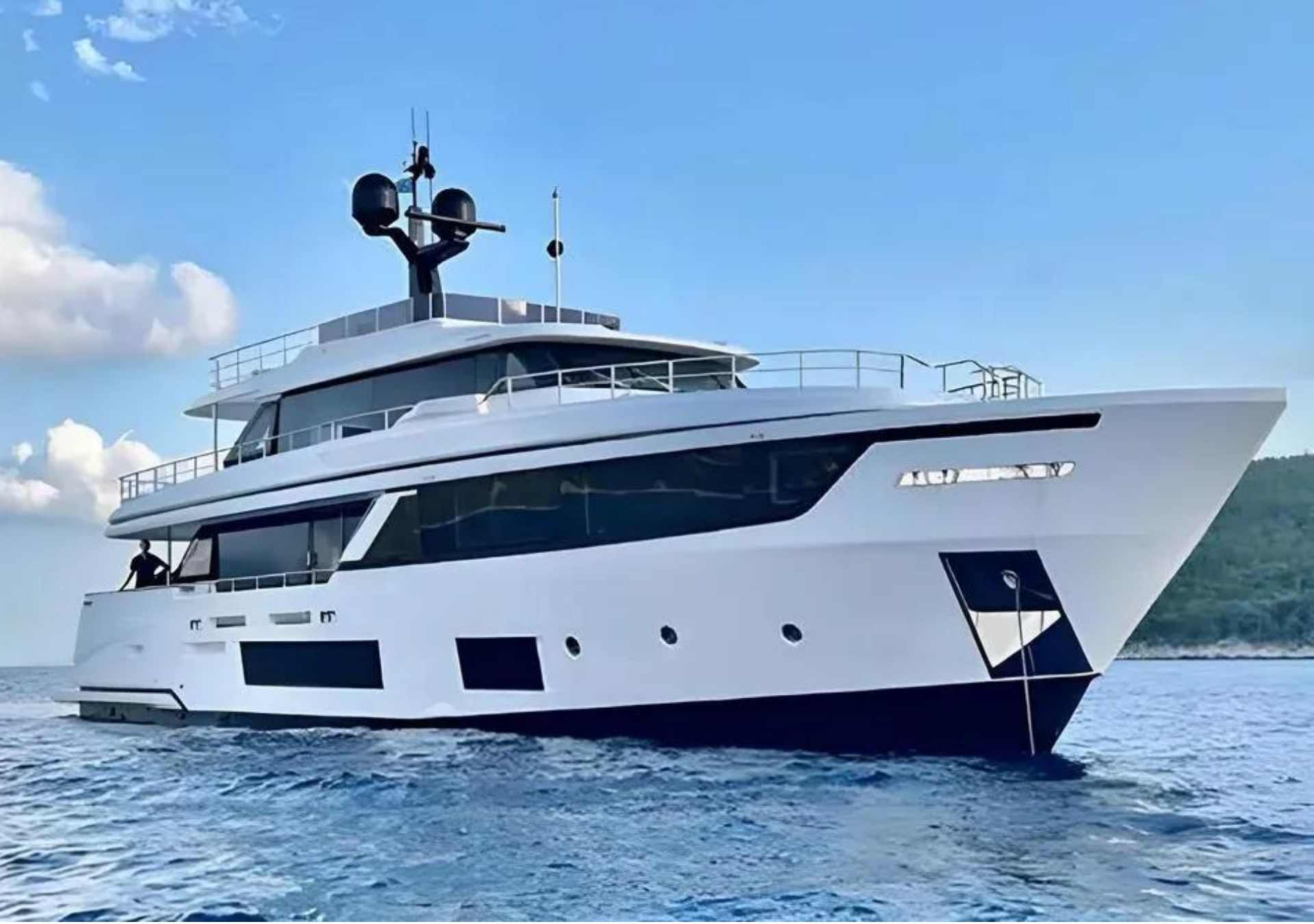
Location: Cannes, France