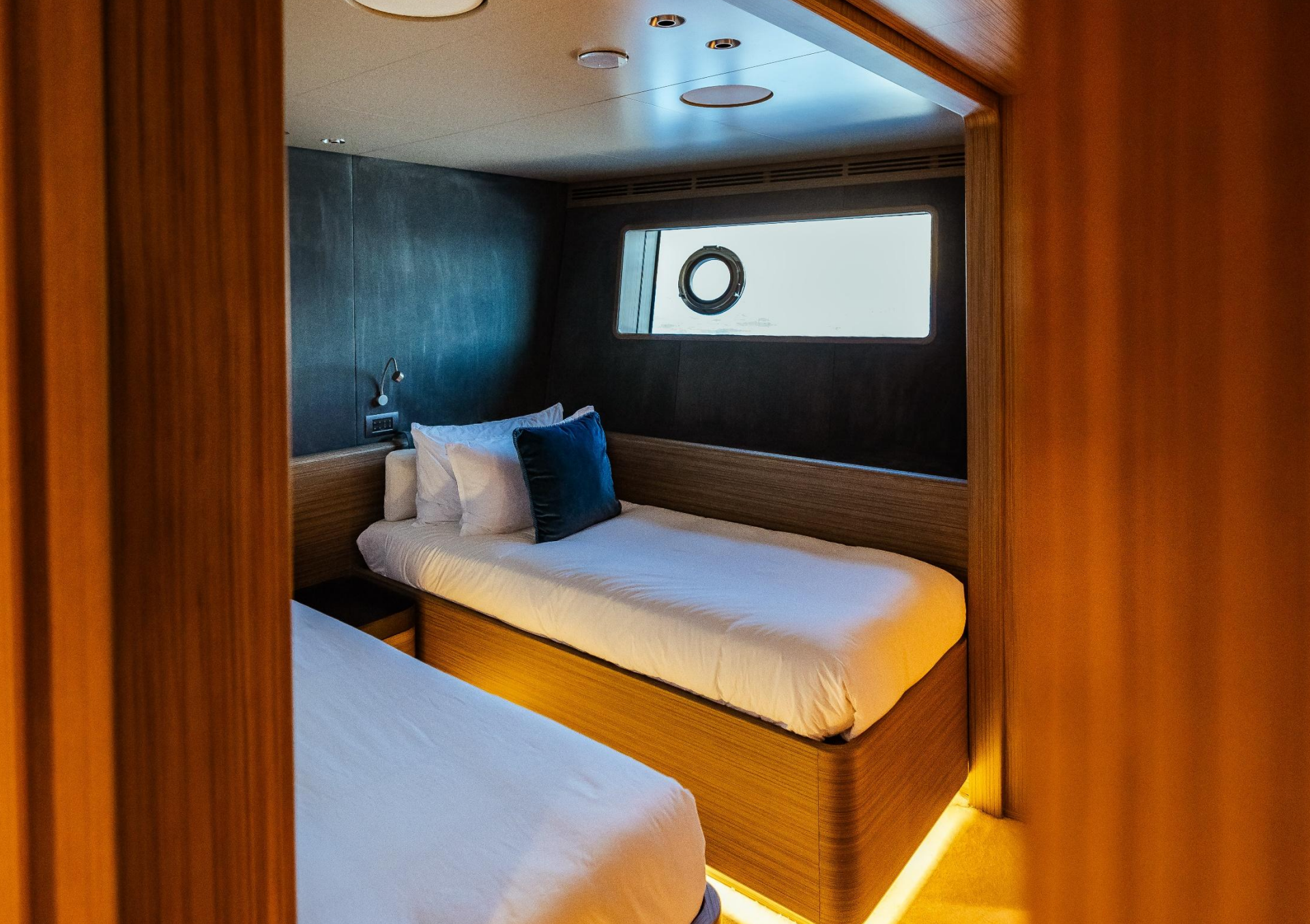
Twin Cabin Port