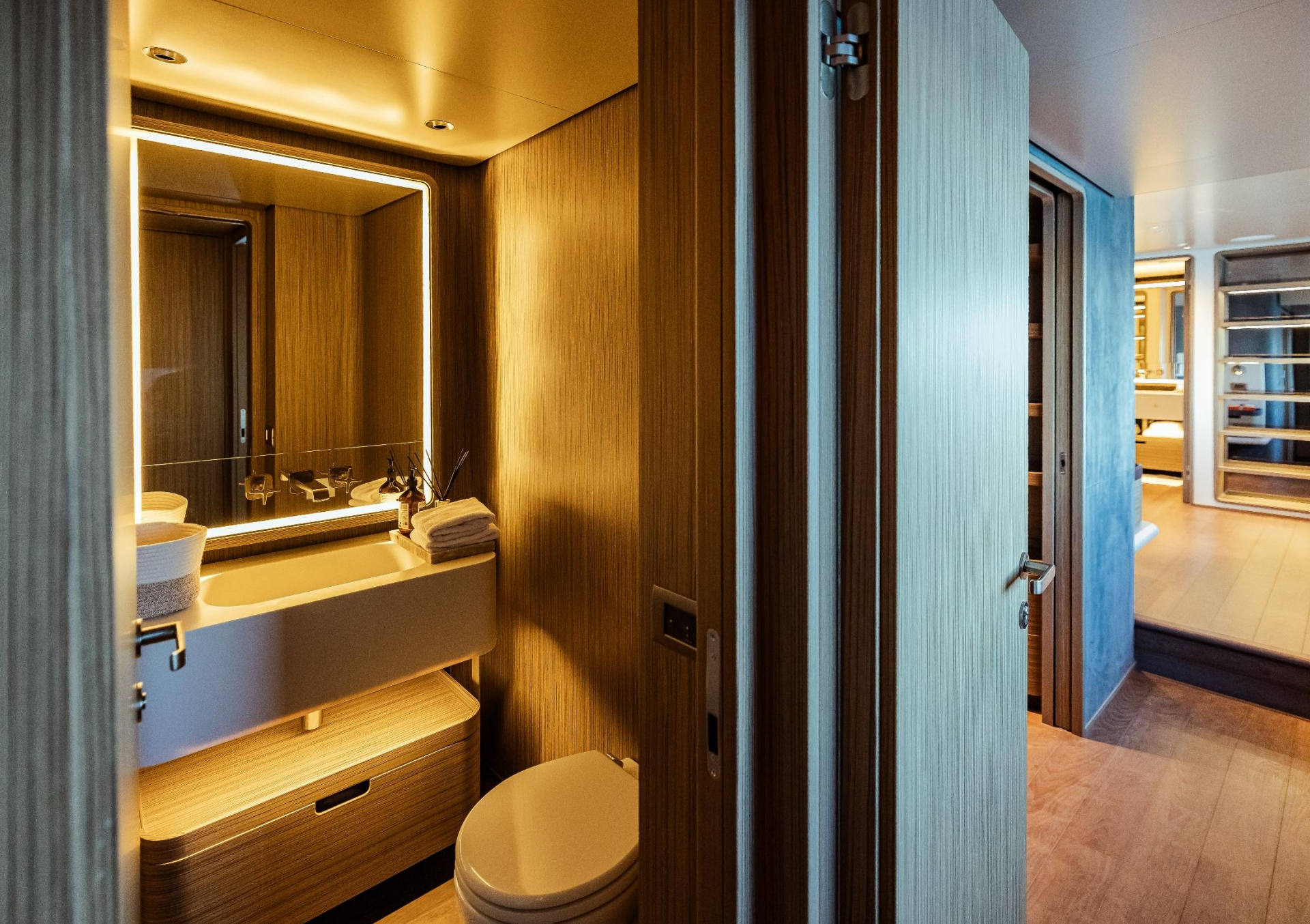
VIP Head Port