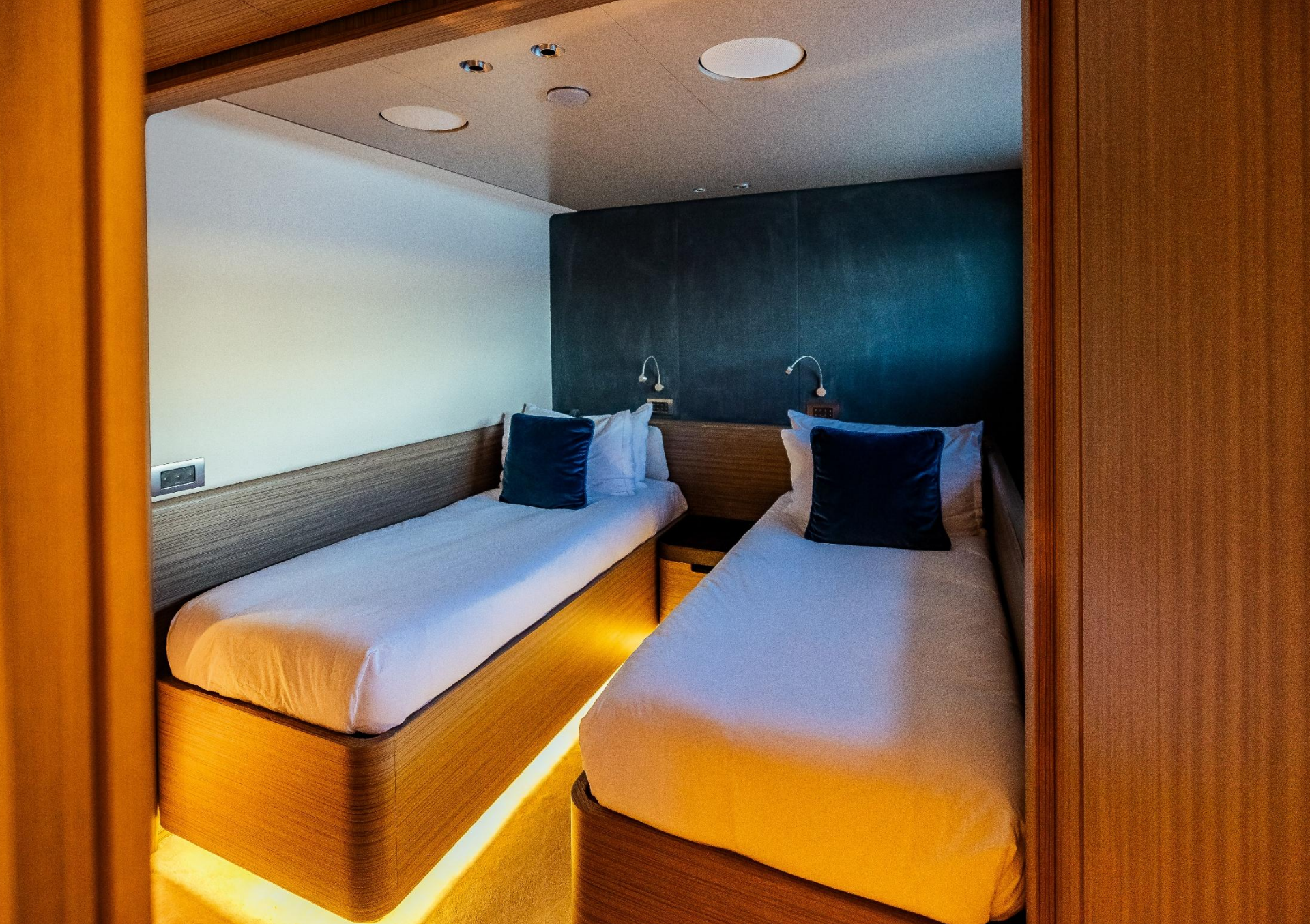
Twin Cabin Port