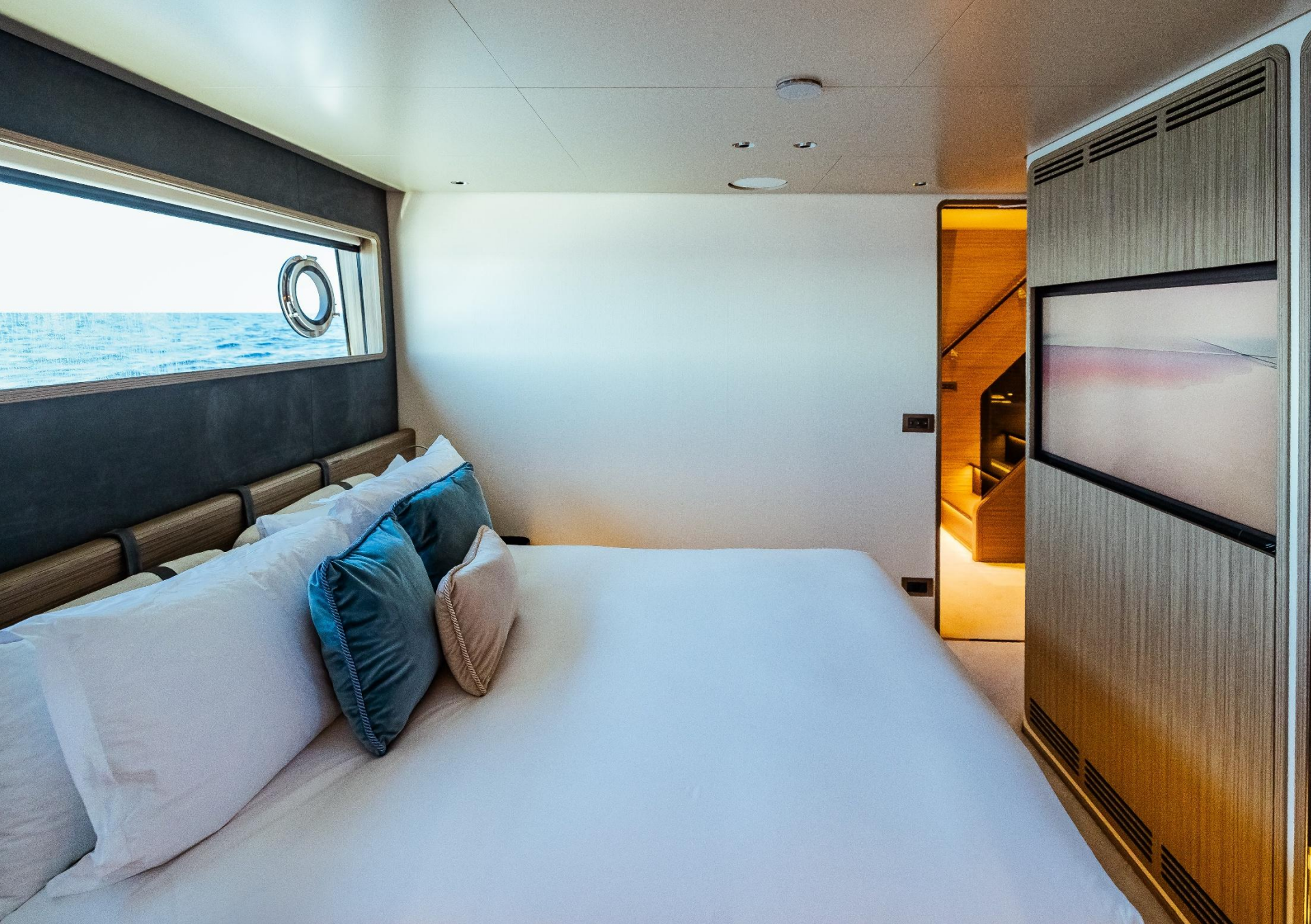
VIP Cabin Port