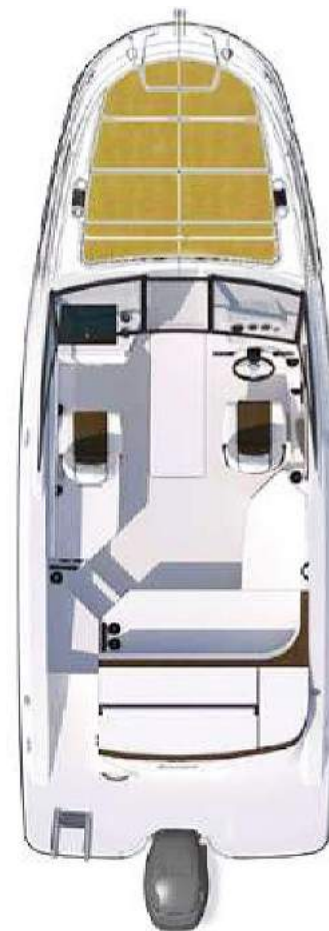
Cockpit & Bow Pad

Bottom Paint Submersible Swimplatform, Manual Operated Canvas Enclosure package incl: Aft Curtain, Front & Side Curtains > Mooring Cover, Black Air Compressor Folding Cockpit Table, Teak Infinity, Woven Cockpit Flooring Sunpad on front deck with Deck Runners Led Package in Cockpit - Blue or White Refrigerator (12 volt) in Cockpit SB Bucket Seat with PS Reversible Loungeseat SeaDek covering on Swimplatform ( Gray or Mocha) Windlass - Electric with Chain & SST Anchor Toilet - Portable Chart Plotter / Fishfinder w/ GPS - Raymarine Digital Dash w/Mercury Vesselview link 9" Mercury Active Trim Premier Stereo w/ extra speakers / SW & Transom remote on 230 Transom Trailer Trim Switch On Board Battery Charger