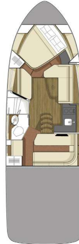
STANDARD CABIN LAYOUT