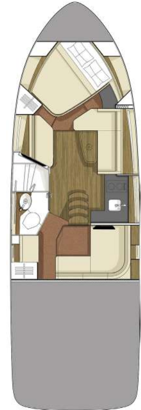
OPTIONAL CABIN LAYOUT Shown w/Optional Mid-Berth 'L-Shaped' Seating (Converts to sleeper)