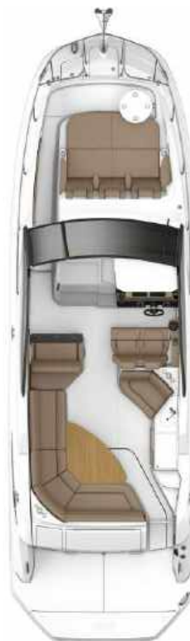
DECK / COCKPIT LAYOUT (Shown w/ Optional Equipment)

NOTE: Some features and options may not be available when a boat is built for regions outside North America and/ or has CE Certification. Boats ordered with 220V/50 cycle electrical systems will have the appropriate appliances in the corresponding voltage.