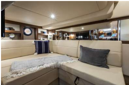
The luxurious, wood-trimmed mid-berth includes convertible twin beds that convert to a double berth w/slide-out base & dedicated filler cushions. (Shown with optional mid-stateroom L-shaped seating layout.)