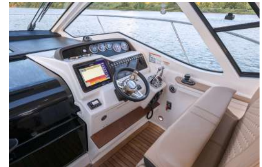
The well-designed, tiered helm station features standard SmartCraft® diagnostics and VHF Radio plus plenty of room for an optional Digital Dash w/ 9" or 12" Simrad® 4G Radar/Chartplotter.