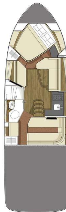
STANDARD CABIN LAYOUT