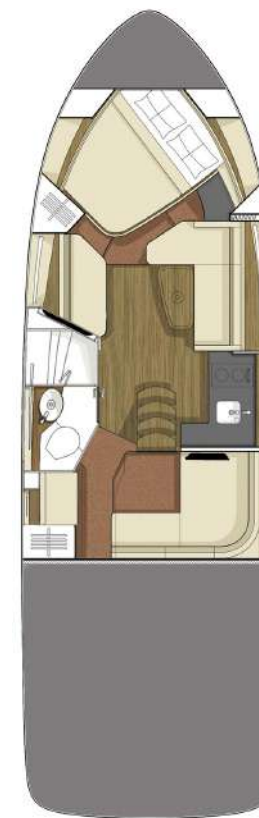
OPTIONAL CABIN LAYOUT Shown w/Optional Mid-Berth 'L-Shaped' Seating (Converts to sleeper)