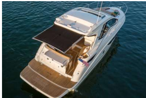
An optional cockpit retractable sunshade and transom Gourmet Station make for an inviting and comfortable social zone.