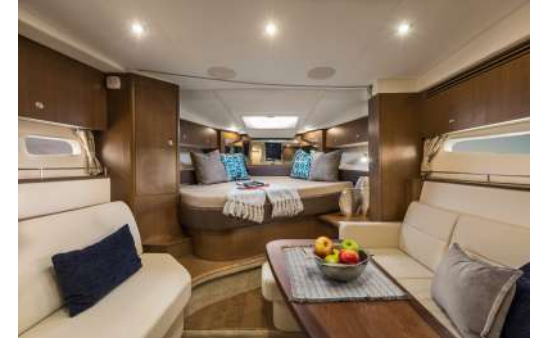
The 350's V-berth comes fully equipped so you can rest easy. The double bed is outfitted with neutral sheets as well as a luxurious memory-foam mattress.