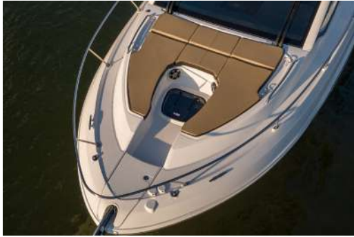
The Coupe foredeck features an enhanced bow seating configuration, adjustable & articulating backrest, cupholders and integral speakers.

Regardless of your destination, this spirited performer will get you there with enough class and fashionable flair to satisfy the most demanding guest. The 350 delivers refined luxury with a contoured Coupe fiberglass hardtop, ingenious Coupe foredeck seating, ample cockpit seating and amenities galore. The helm is designed to seamlessly integrate a range of standard and optional navigational gear, and eases control of the MerCruiser® engines or the optional Axis® propulsion system