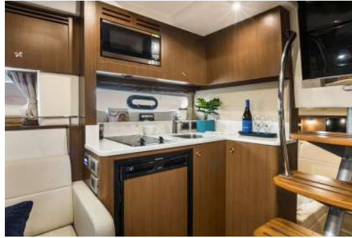
From the deluxe galley with ample storage to the solid-surface counter tops and recessed stove, the Sundancer 350 Coupe is fit for a top chef.