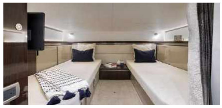
For ducking out of the elements or making an overnight or weekend-long getaway, the Sundancer 320 features a beautifully designed cabin with sleeping accommodations for 4. In the aft berth, two sliding twin beds can be combined to form a queen bed.