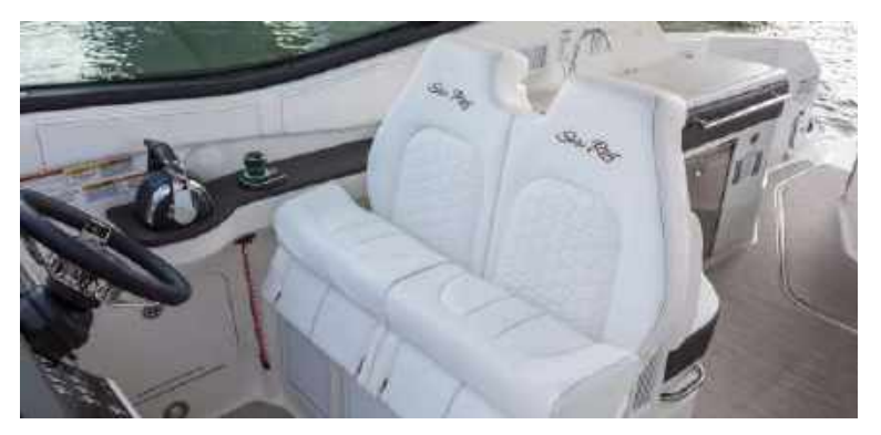
The cockpit affords effortless, versatile enjoyment of the water, with a natural flow from the helm all the way through the transom and onto the integrated swim platform. A reversible helm companion seat converts to face aft, facilitating conversation with the rest of the cockpit. A well-equipped standard wetbar includes a sink and storage, and offers a refrigerator and grill as options.