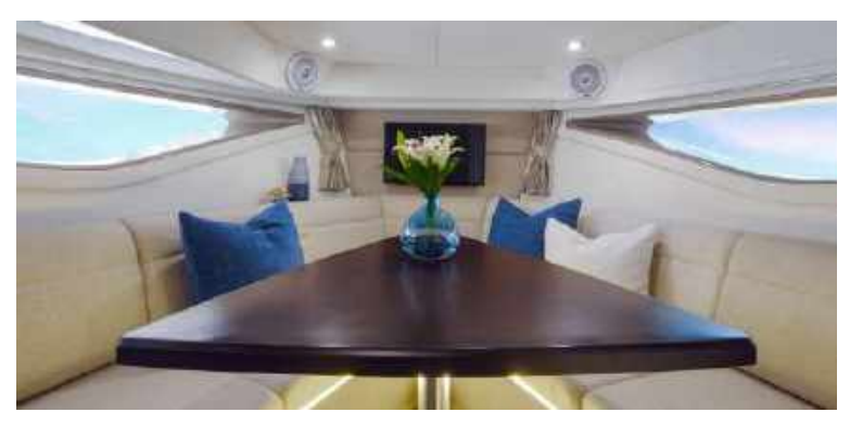
In the forward Salon / V-berth, a stylish table converts via filler cushion to form a comfortable full-sized bed. A deluxe head, gourmet-ready galley with extending countertops and generous storage round out this inviting space.