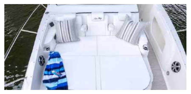
The traditional bow sunpad has evolved into a much more robust lounge seating area, inviting a group to socialize and enjoy the view. The best part? The bow can be fully enjoyed while underway. Actuated headrests, armrests and seats allow users to adjust for perfect comfort, with a stowable table conveniently in reach. An optional bow sunshade can extend over the area to offer protection from the sun while at rest.

Some find it hard to disconnect, but it's easy when a Sea Ray Sundancer is your escape plan. Cast off and chase relaxation with the mobile pampering that a Sea Ray sport cruiser offers. Social zones in the cockpit, on the bow or swim platform, in the salon or mid-cabin—all around the boat—help your whole crew settle into conversation and ease into the relief of letting go. Leave the everyday behind for the better day ahead.