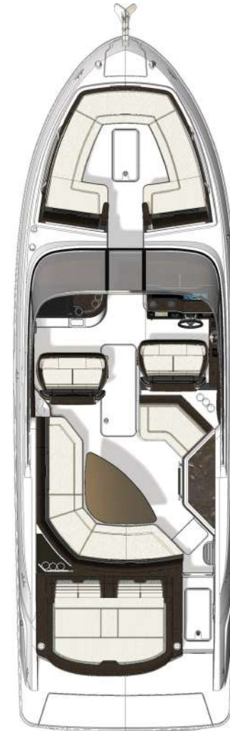
Standard Seating Plan

Aluminum Tri Axle Trailer w/ Bunks & Tri Axle Disc Brakes