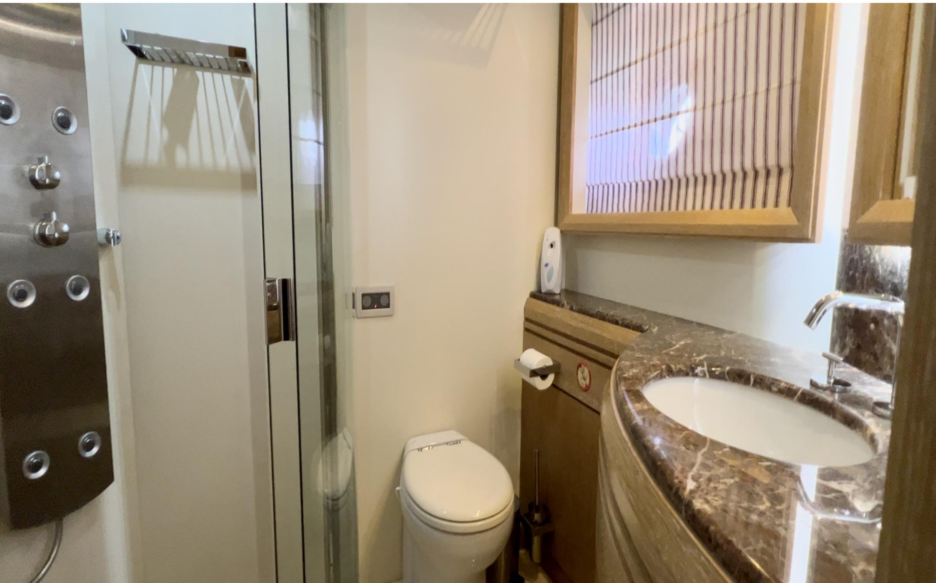
VIP PORT CABIN HEAD