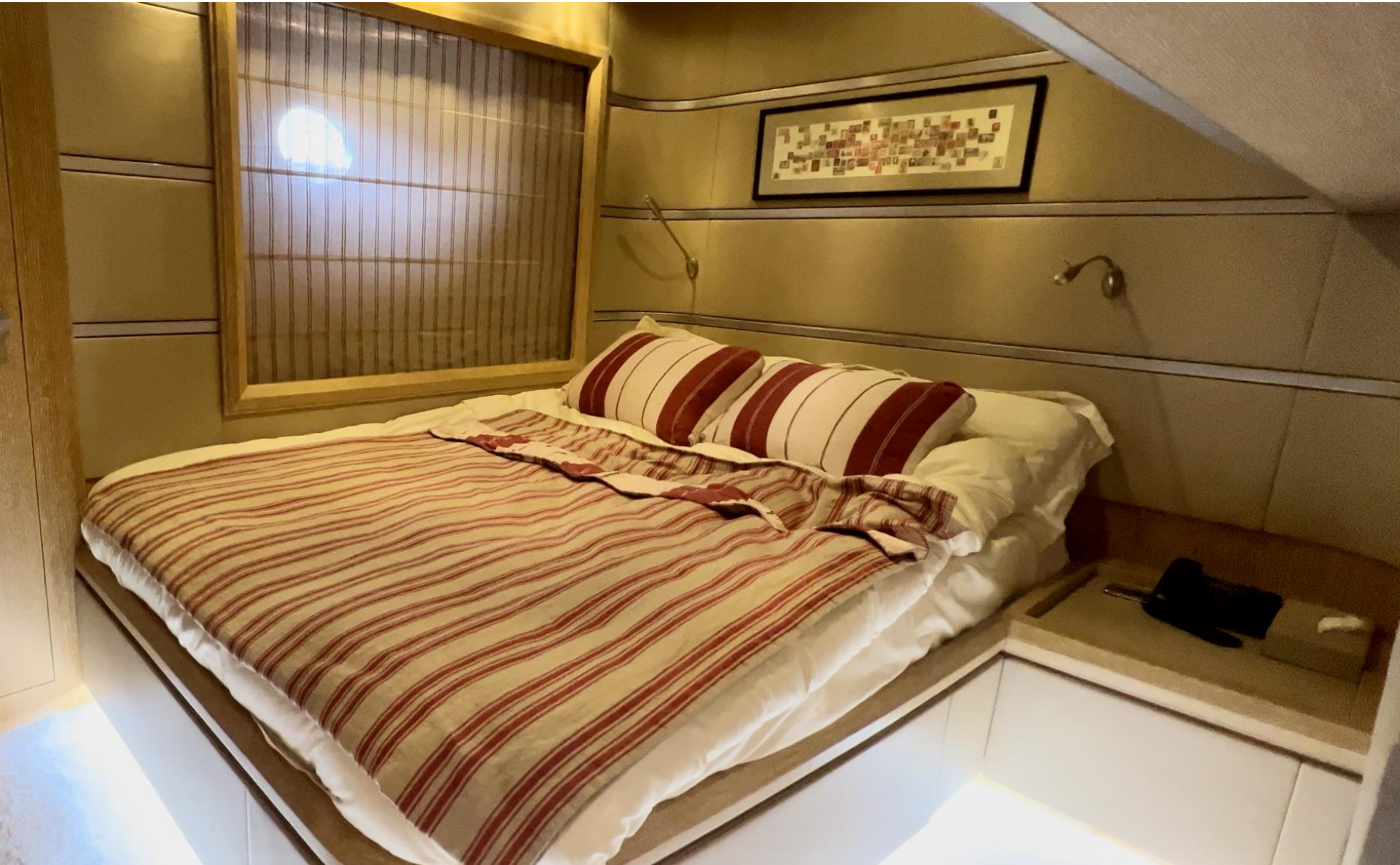
VIP STRB DOUBLE CABIN