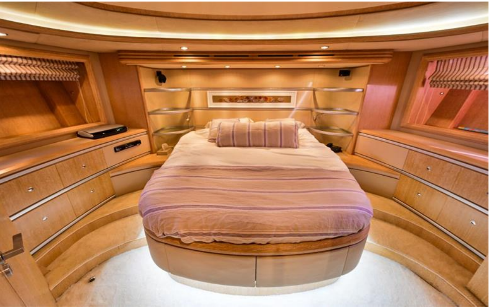
VIP PORT DOUBLE CABIN