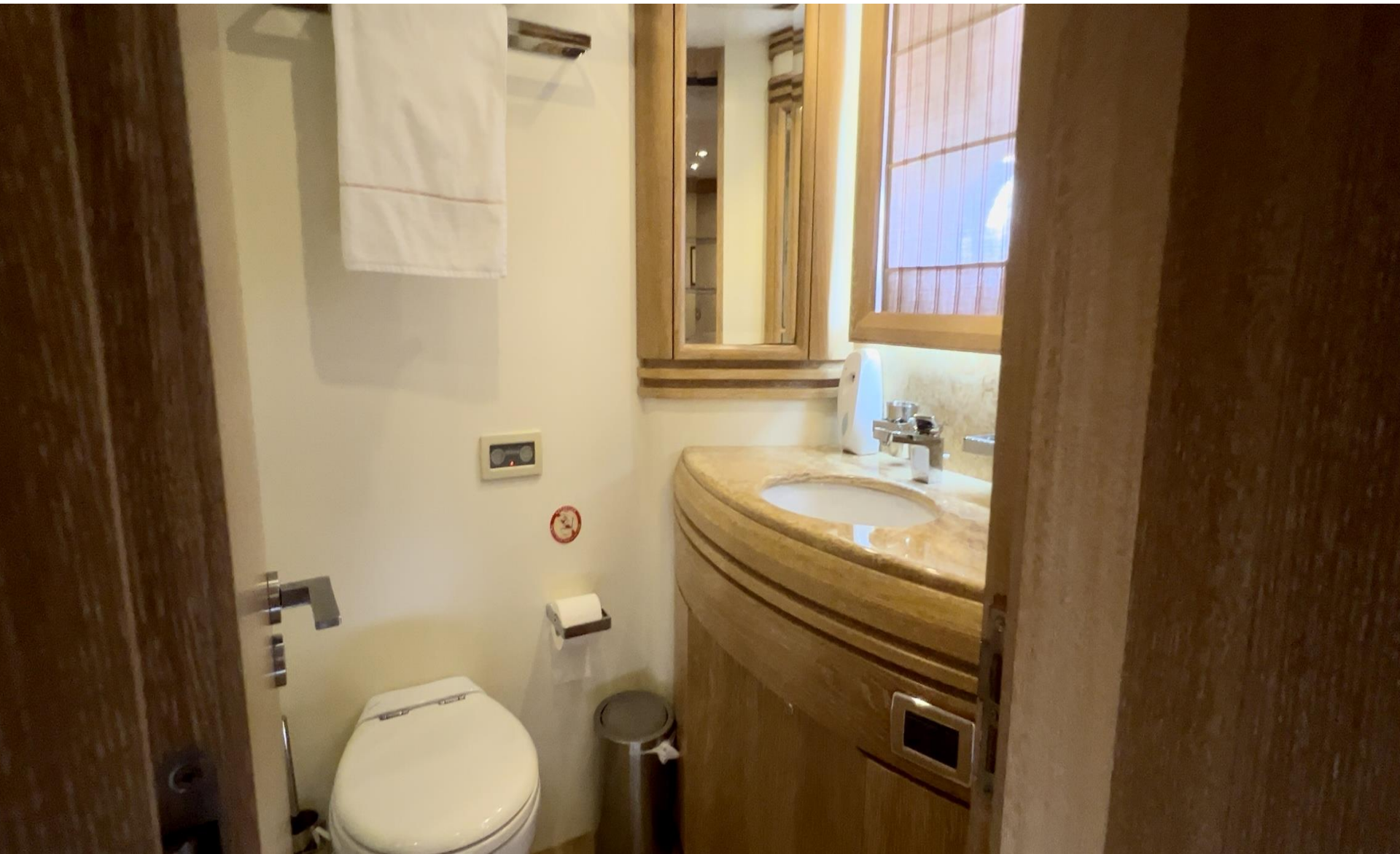
VIP STRB DOUBLE CABIN HEAD