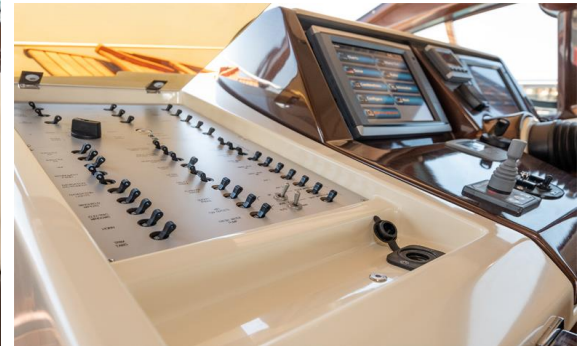
MAIN HELM STATION