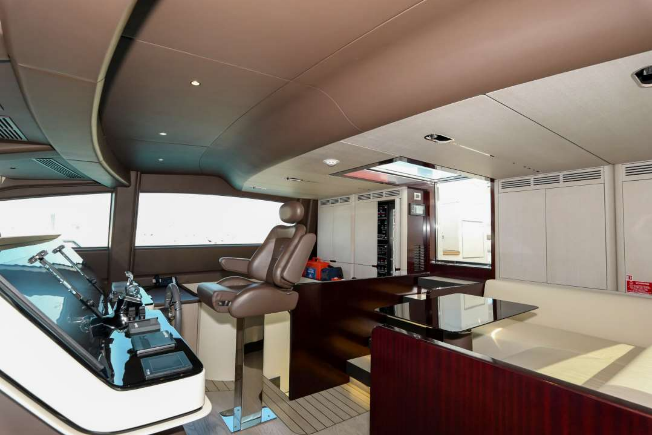
Main Helm Station