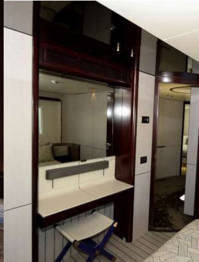
Strb VIP Cabin