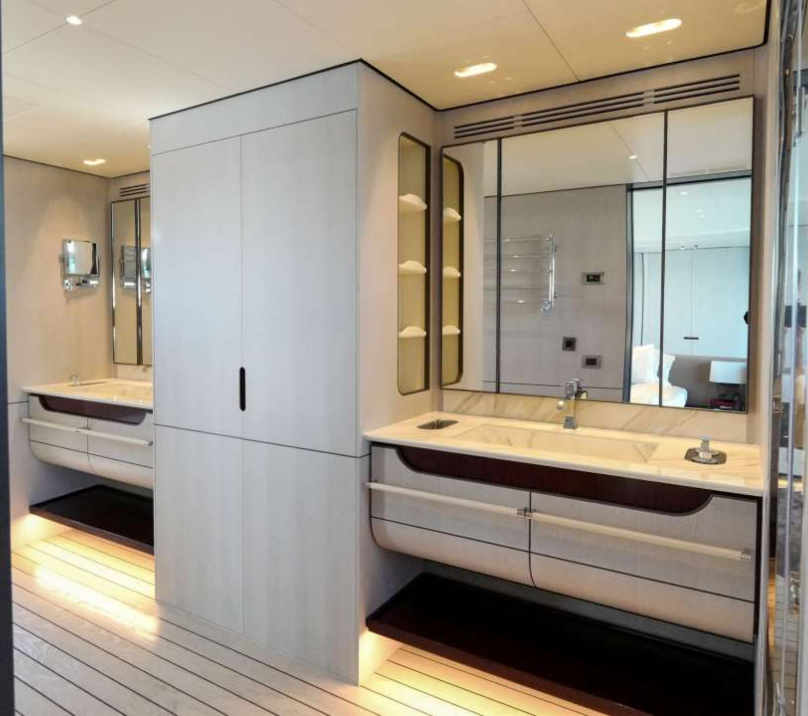
Master Cabin Head