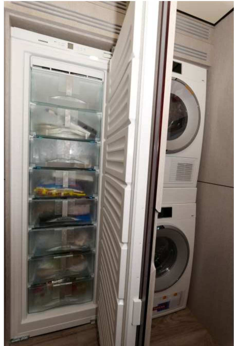
Pantry & Galley Area