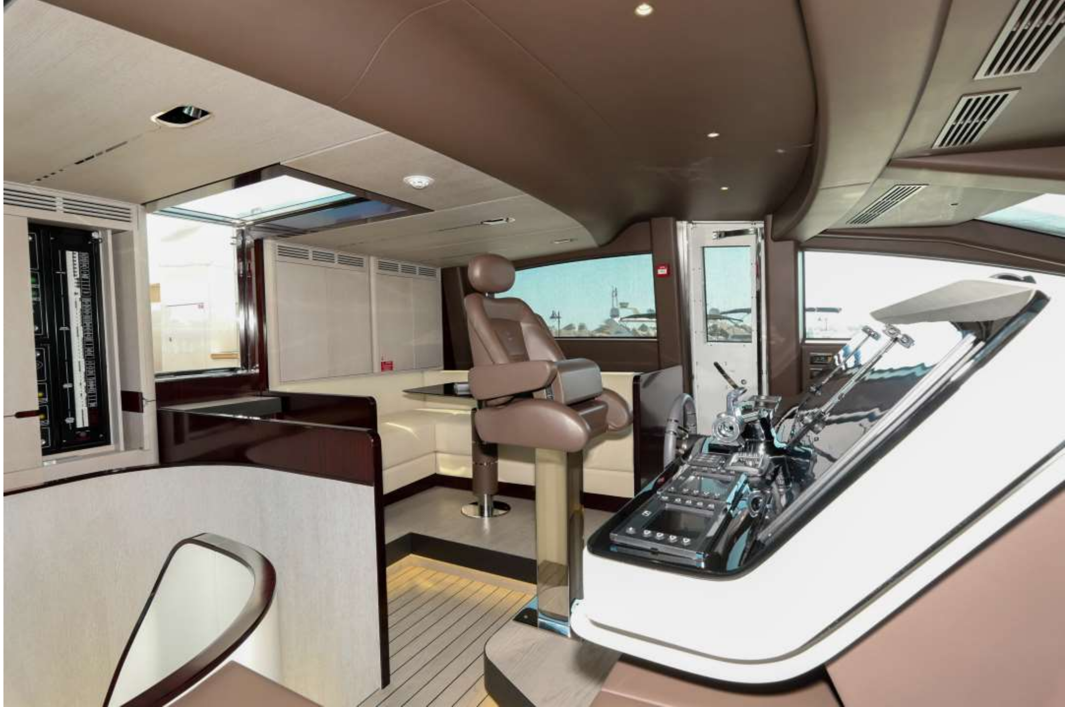
Main Helm Station