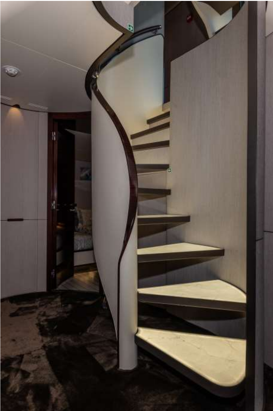
Stairs to Lower Deck and Wheel House with backlight Onyx