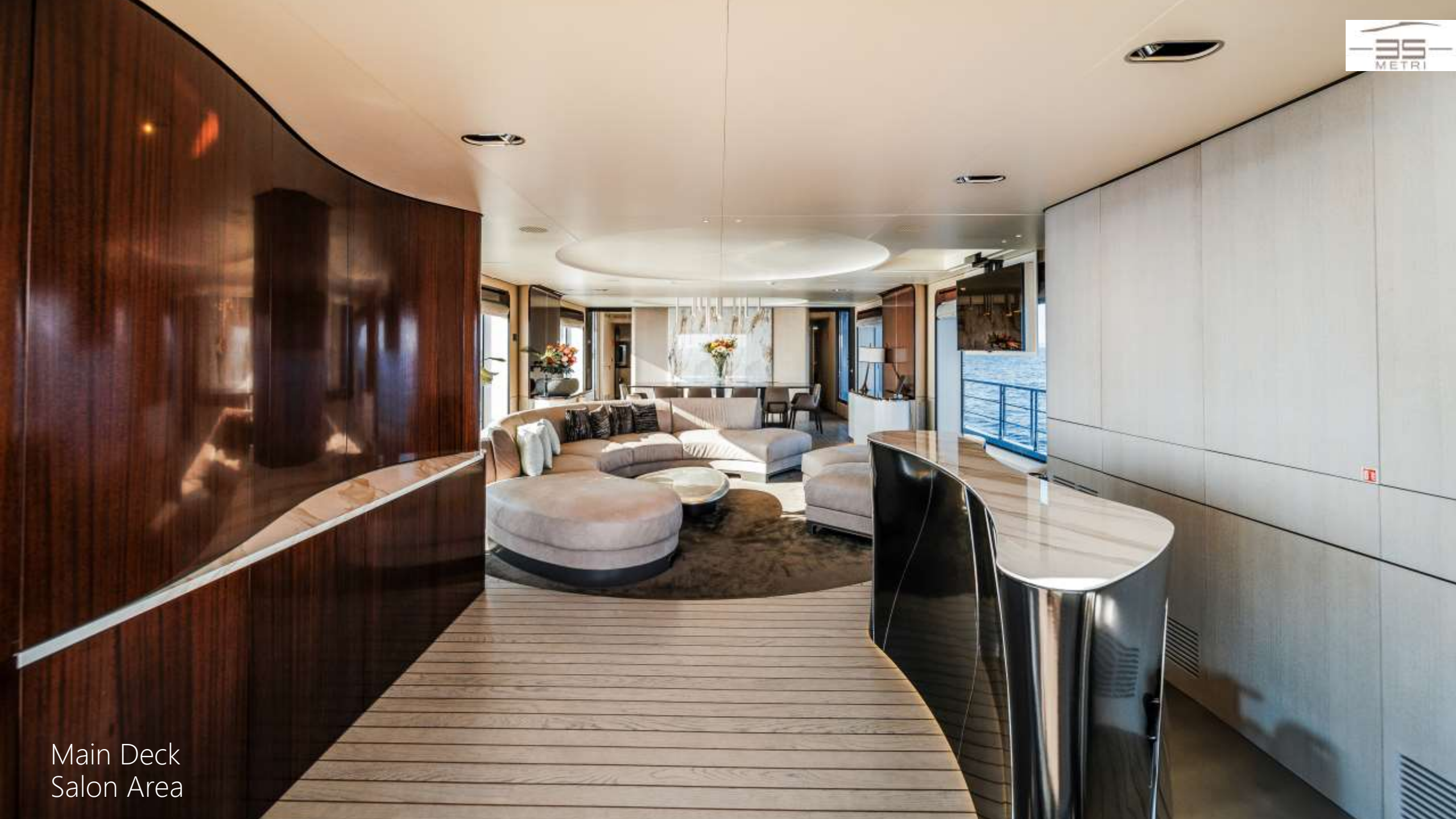
Main Deck Salon Area