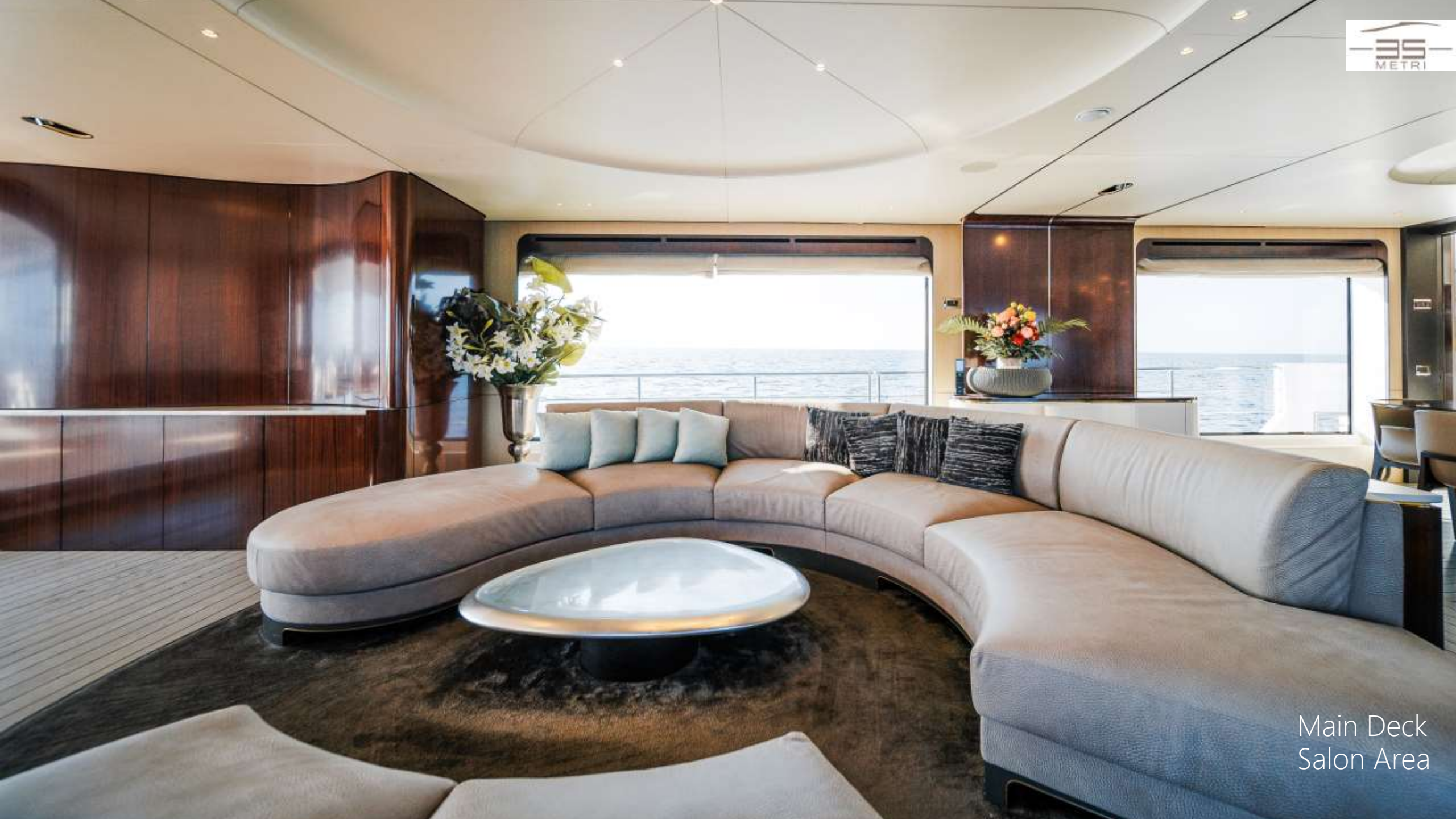
Main Deck Salon Area