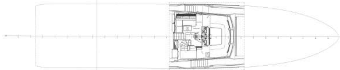
Raised pilot house