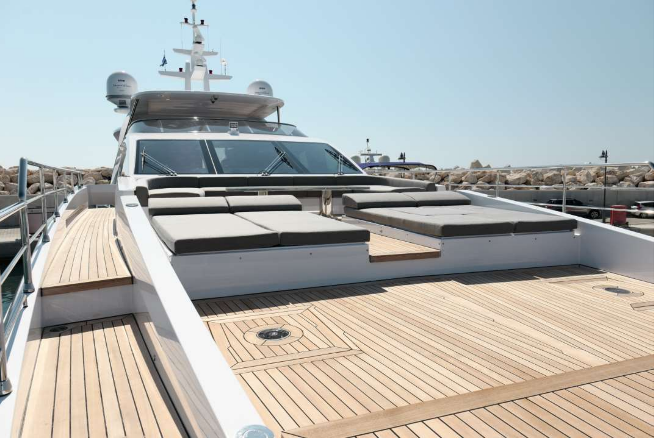
Foredeck lounge, Sunbathing area