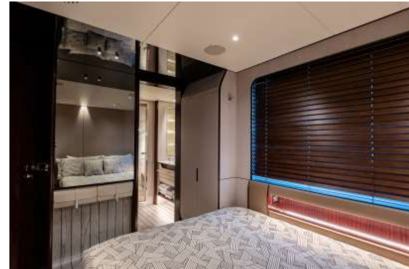
Port VIP Cabin