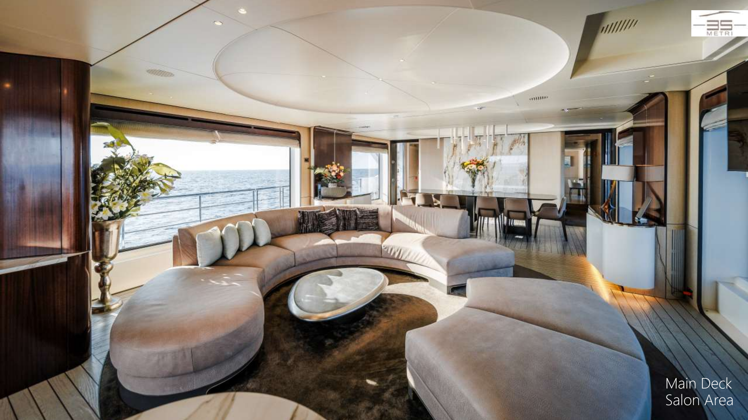
Main Deck Salon Area