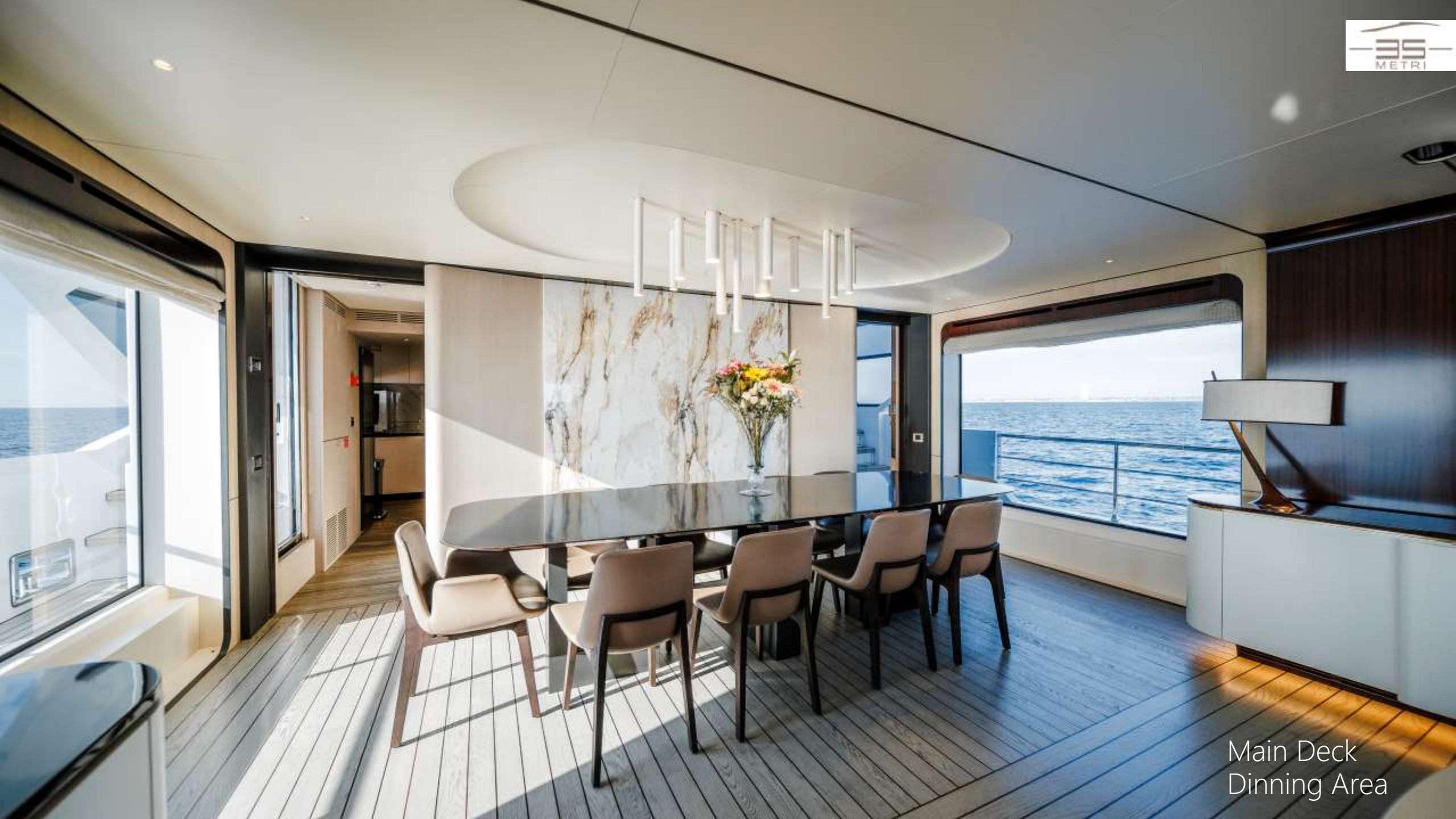
Main Deck Dinning Area