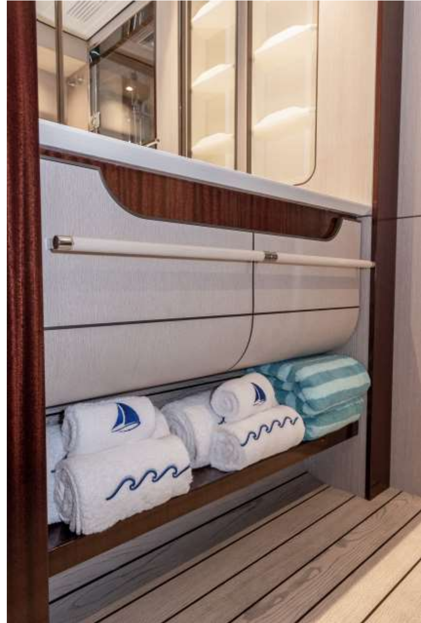
Strb Guest Cabin Head