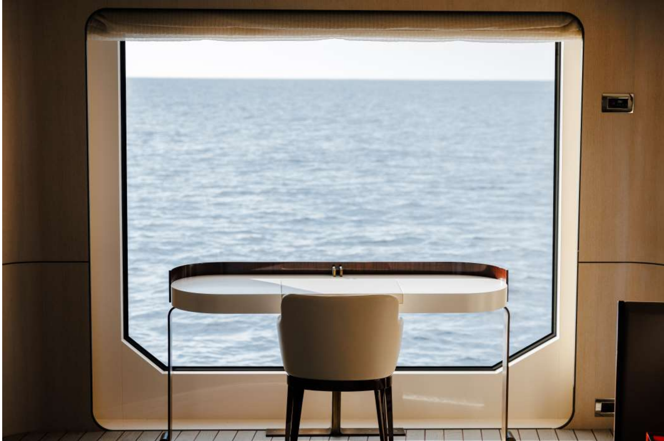
Master Cabin Vanity Table