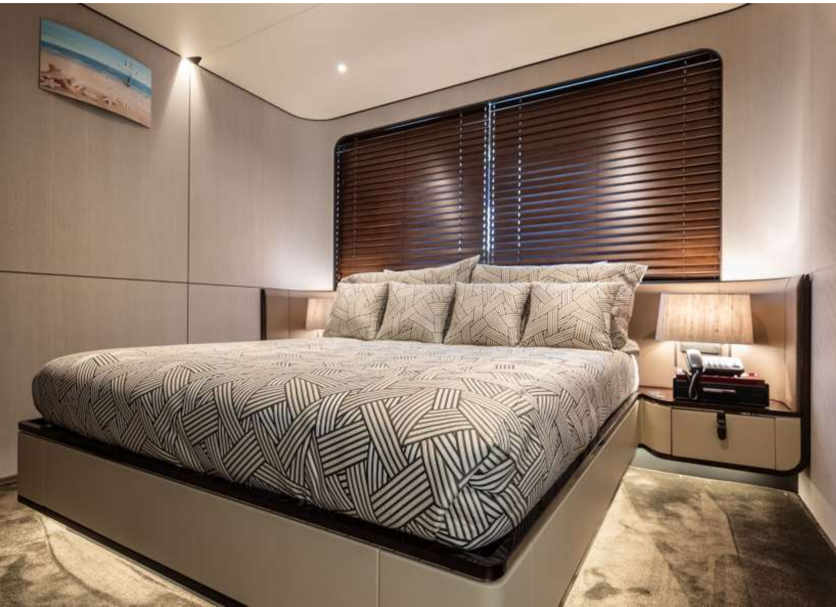
Port VIP Cabin