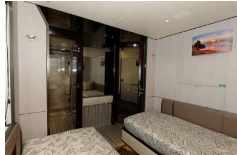
Strb Guest Cabin