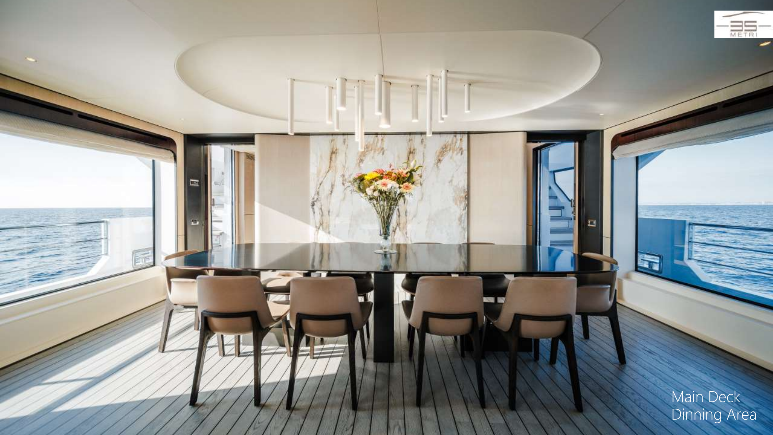
Main Deck Dinning Area