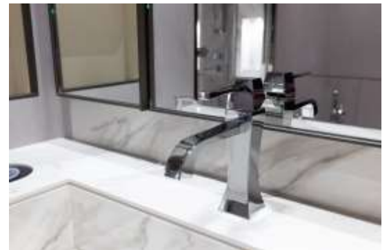
Port VIP Cabin Head