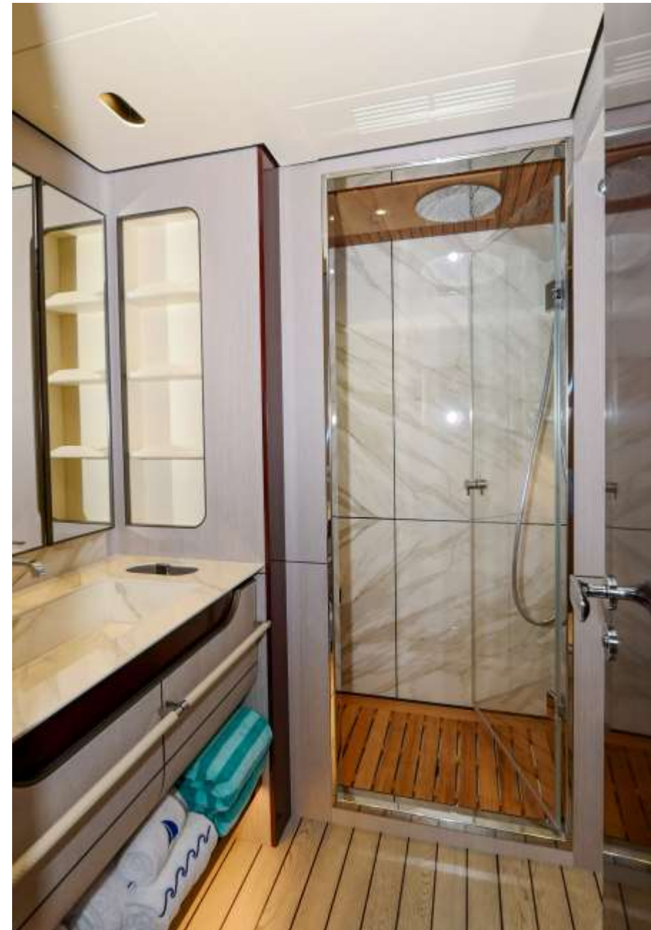
Strb VIP Cabin Head