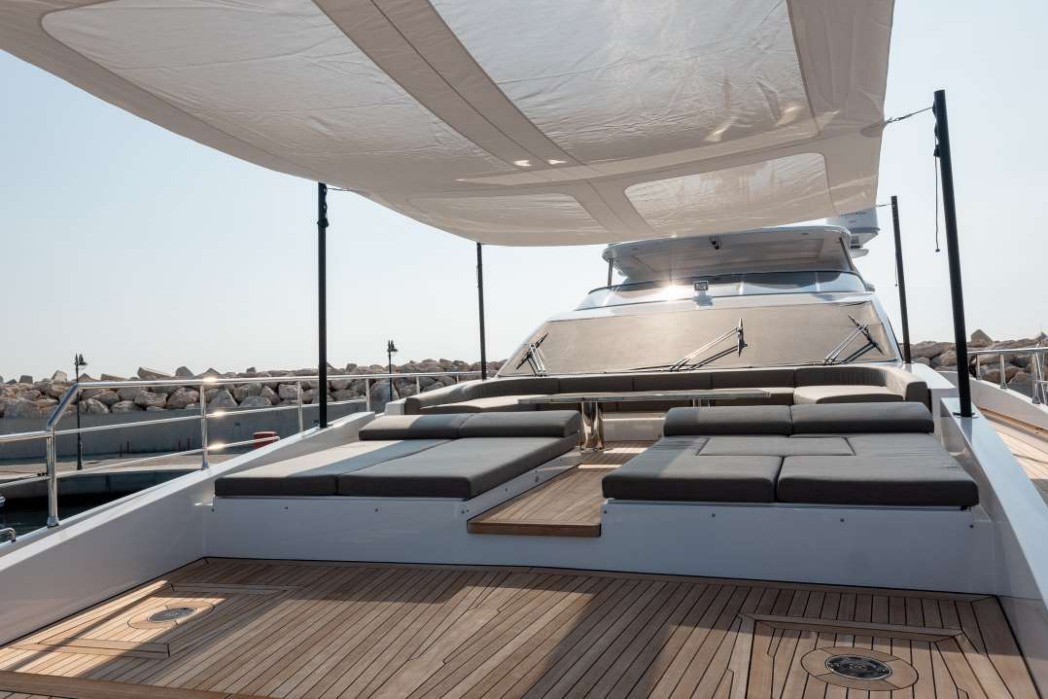
Foredeck lounge, Sunbathing area