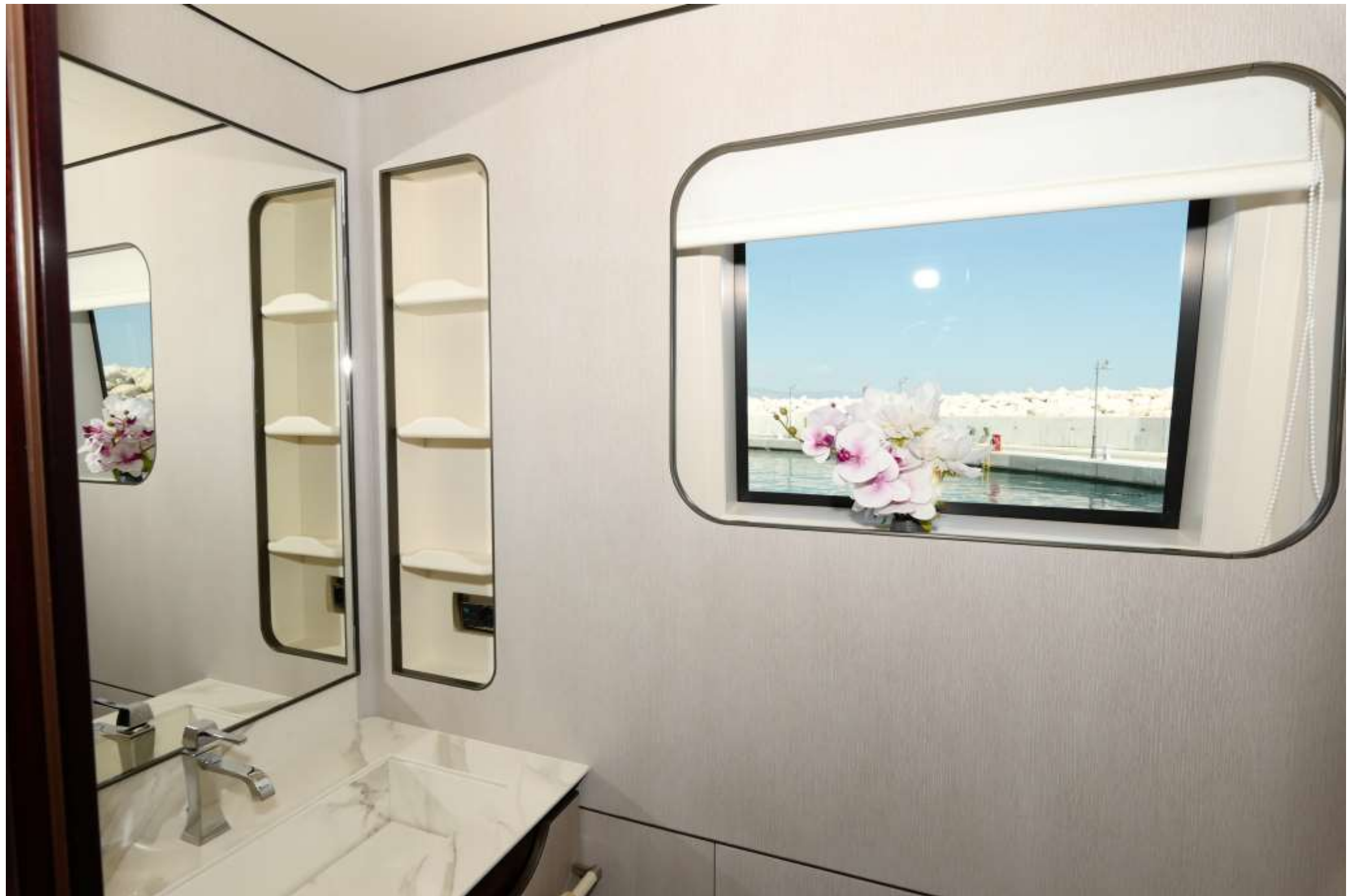
Day Head At Main Deck